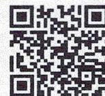
QR Code for pre-registration